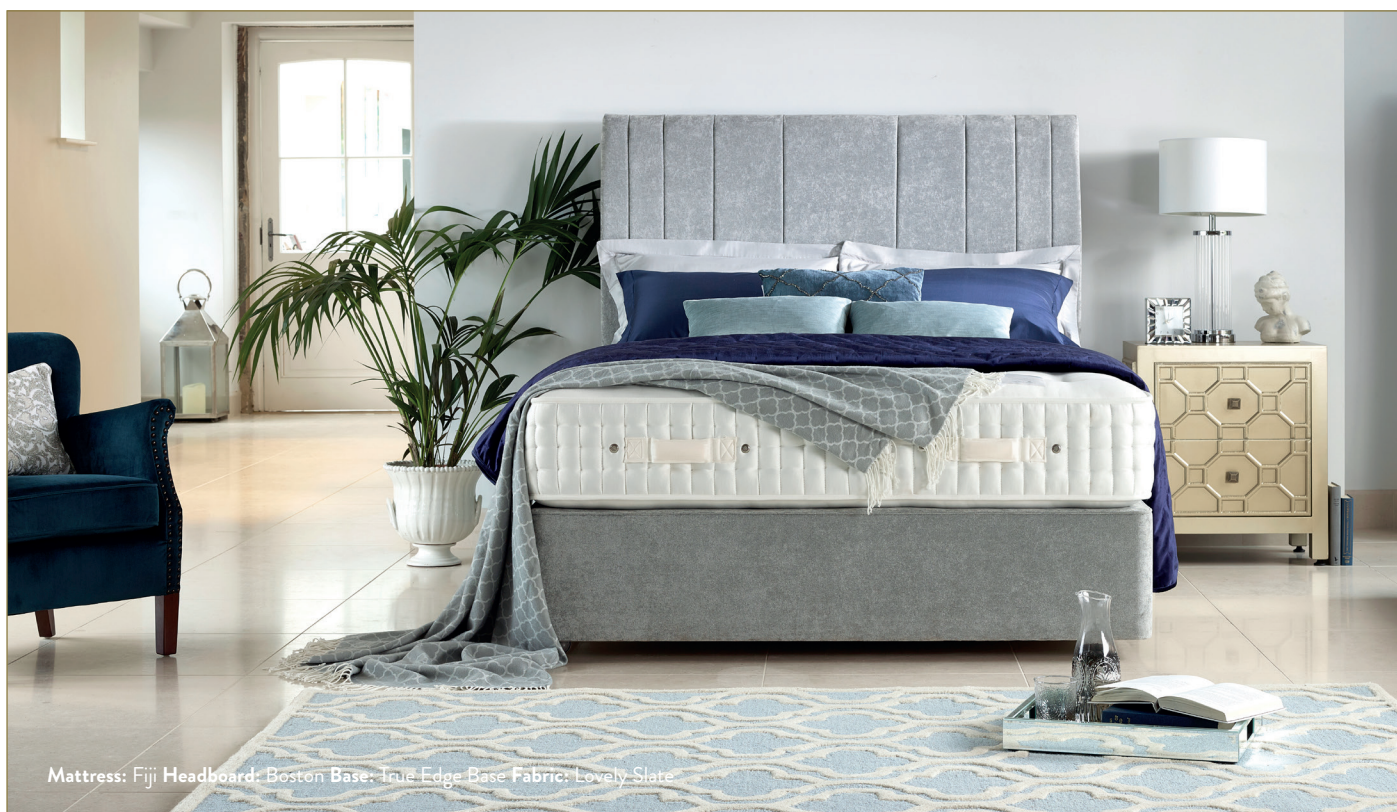
Mattress: Fiji Headboard: Boston Base: True Edge Base Fabric: Lovely Slate

With layers of blended viscose and British wool, home-grown hemp and flax, crisp cooling Egyptian cotton and sustainable Ecotex. The Fiji has 8250 innovative springs; including 100% recyclable advanced Cortec™ Quad pocket springs, pressure relieving HD 4000 and HD 2500 Micro springs and Posturfil pocket springs for targeted support. With an in-house woven FR chemical free mattress cover and three rows of side stitching, this mattress is turn free for your convenience. Choose from our three levels of support; gentle, medium or firm.